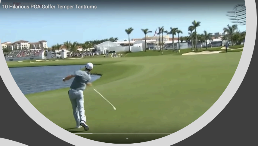
10 Hilarious PGA Golfer Temper Tantrums