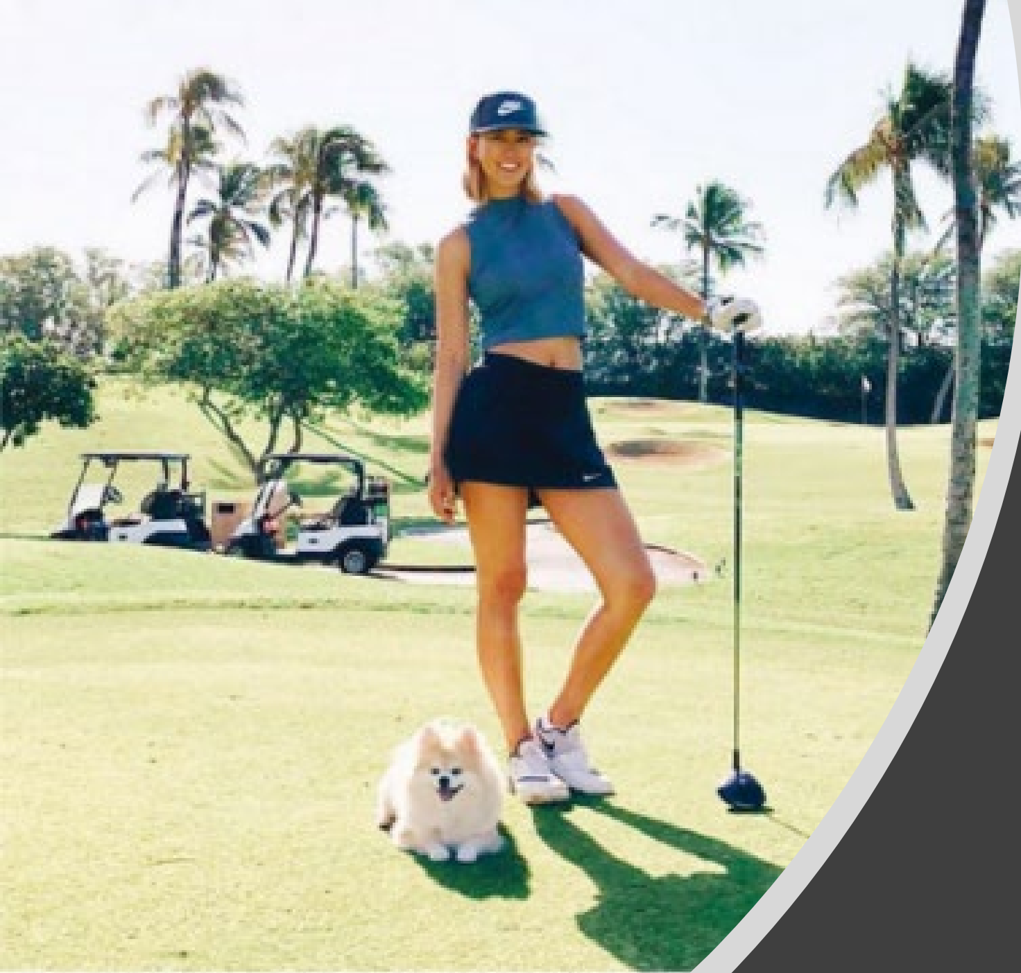
Michelle Wie (Dress Code Violations)